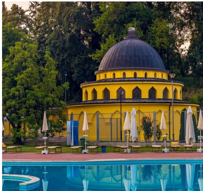
Health and Tourism Complex "Laktaši Spa"